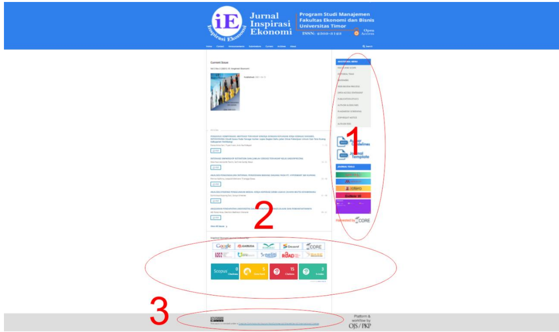
Figure 7. Updating information on the OJS page of the Inspirasi Ekonomi journal

The last stage is updating all the information writers, readers, and reviewers need about the Inspirasi Ekonomi journal.