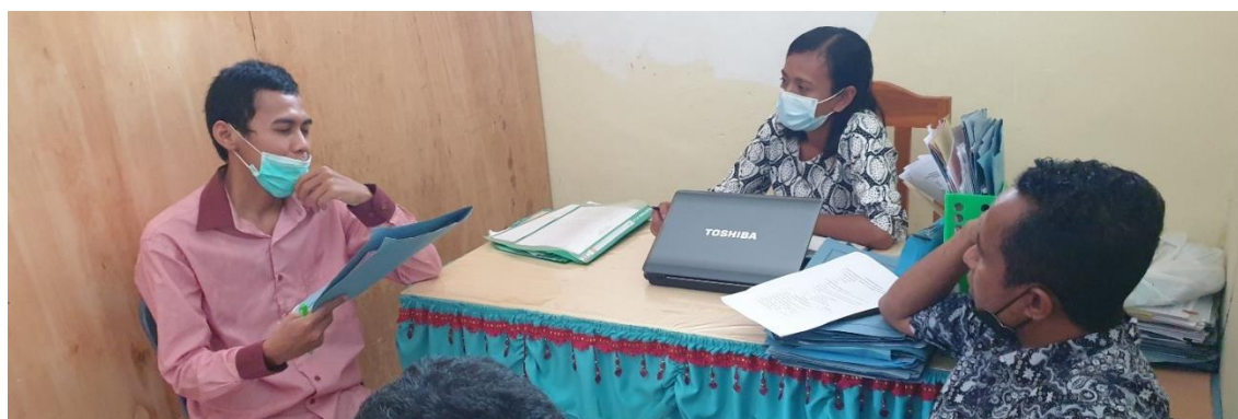
Figure 2. Problem Identification Process of the Inspirasi Ekonomi Journal

Based on the results of the identification using fishbone diagram analysis, the problems causing the issue of not optimal management of the Inspirasi Ekonomi Journal, Universitas Timor, so that the accreditation process cannot be submitted are as follows: 1) There is still a limited number of articles submitted, thus hindering the frequency of publication of the journal; 2) The unavailability of publication ethics statement; 3) do not yet have a google scholar profile; 4) Indexation is not yet optimal; 5) There is still limited information available on the OJS Inspirasi Ekonomi Journal page.