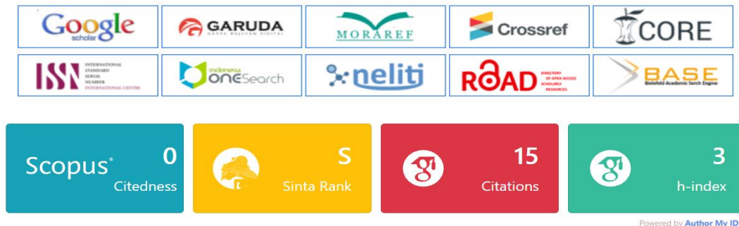
Figure 6. Indexation on the OJS Inspirasi Ekonomi Journal page

The last stage is updating all the information writers, readers, and reviewers need about the Inspirasi Ekonomi journal.